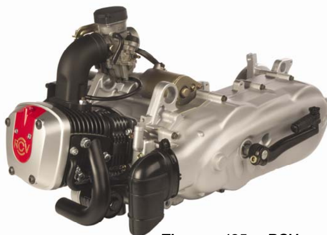
The new 125cc RCV scooter engine developed by RCV Engines Ltd for MPI

"The impressive performance and potentially low manufacturing cost of the 125cc RCV engine developed for MPI demonstrate the potential of RCV technology as an enabler for products with premium performance coupled with high standards of fuel-efficiency and low exhaust emissions".